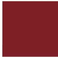
PANTONE® 19-1555 TCX Red Dahlia