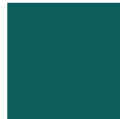
PANTONE Storm 19-5217 TCX